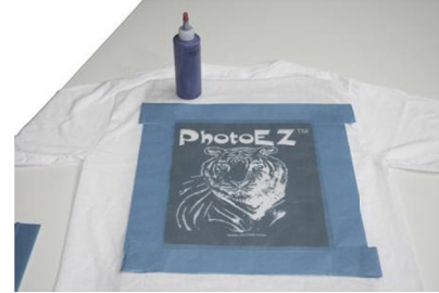
Tape the edges of your PhotoEZ™ stencil.