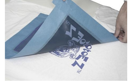
Carefully lift your PhotoEZ™ stencil.