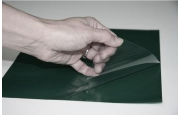
Remove protective film from PhotoEZ™.