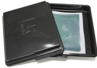
Develop PhotoEZ™ in water.