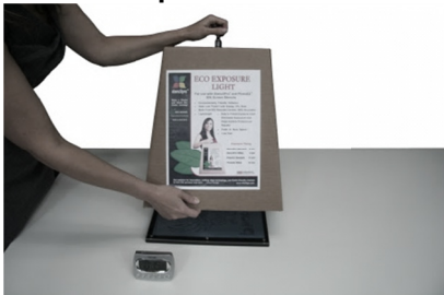
Expose using Eco Exposure Light.