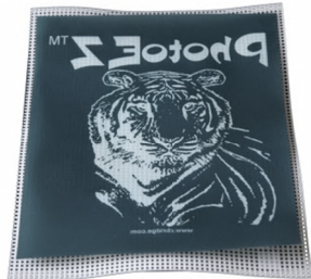
Dry PhotoEZ™ on plastic canvas.