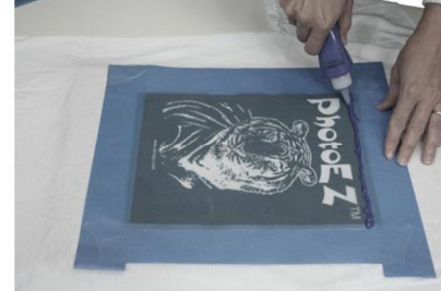
Ink one edge of your PhotoEZ™ stencil.