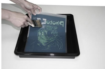
Remove excess emulsion with brush.