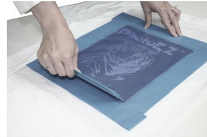
Squeegee ink over PhotoEZ™ stencil.